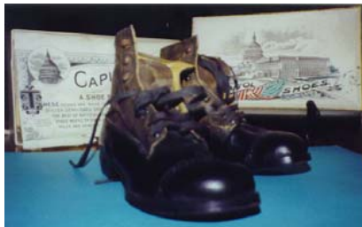
Shoes and box produced in Hudson.